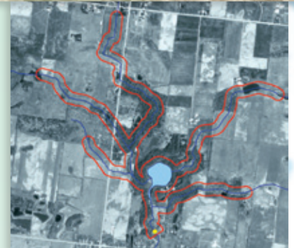
In this example, the yellow dot represents the location of the water intake. The red lines show the area of the Intake Protection Zone.