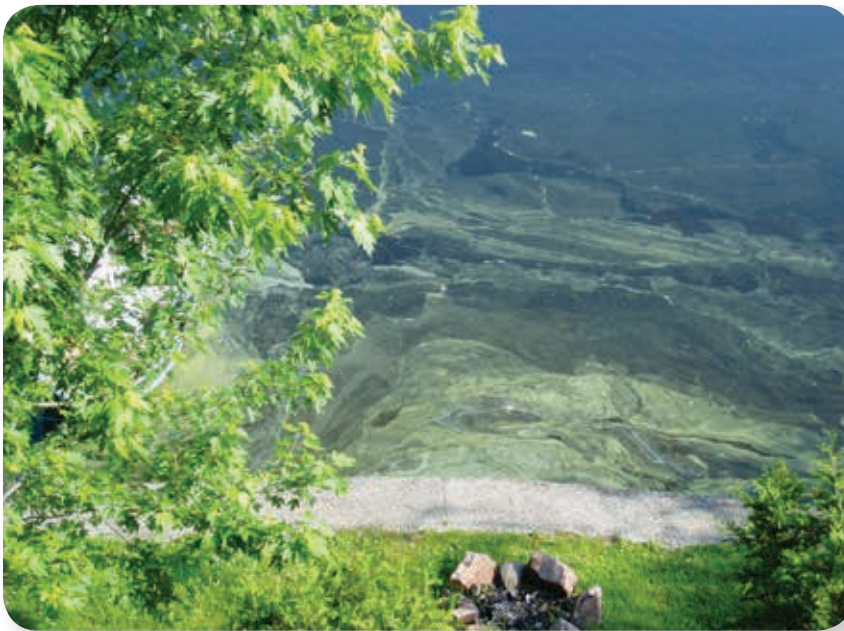
Colonies of microscopic blue-green algae appear on a lake during a bloom. Blooms occur mostly during late summer and early fall.

Human activities can promote the growth of blue-green algae. For instance, agricultural, urban and stormwater runoff, effluent from sewage treatment plants and industry, and leaching from septic systems can elevate the levels of nutrients in water bodies, which can promote algae growth. Reducing or eliminating nutrient inputs from these sources is a proactive way to reduce the occurrence of blue-green algal blooms.