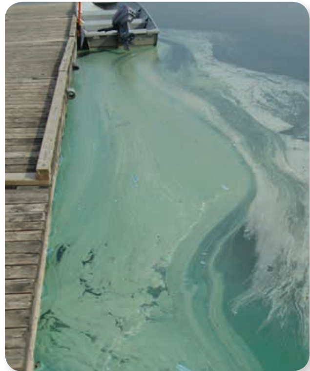
Blue-green algae thrives in warm, shallow, slow-moving water. Blooms are commonly found near docks and shoreline areas.

The Ontario Drinking Water Quality Standard for microcystin-LR (a common algal toxin) is a maximum acceptable concentration of 1.5 micrograms per litre, which is the same as 1.5 parts per billion. It is rare for treated water tests in Ontario to exceed this standard, but precautions should still be taken when a bloom occurs.